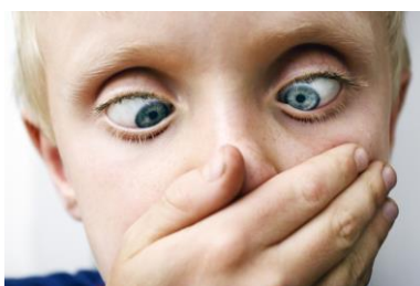
No Sulfur odors too . . .